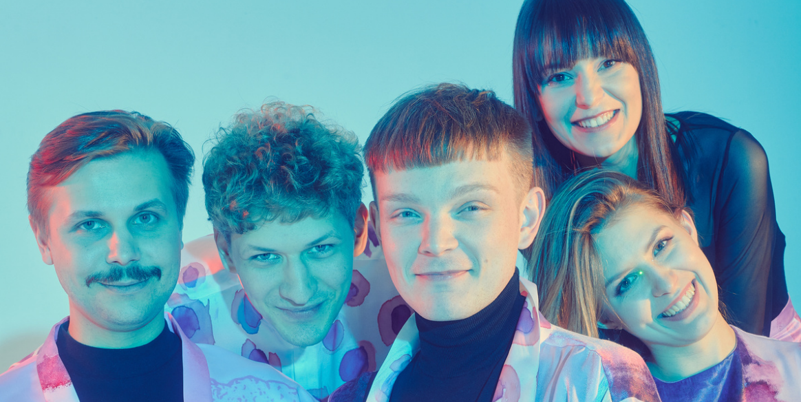
CRACOW HARP QUINTET